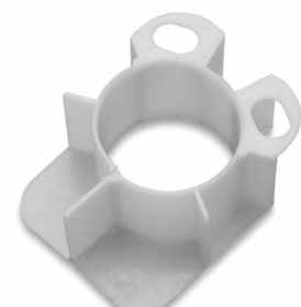
Part No. 49-2667 MS27243-3