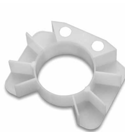
Part No. 49-2661 MS27243-1