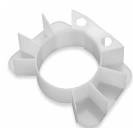
Part No. 49-2670 MS27243-4