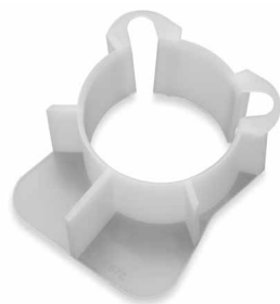
Part No. 49-2665 MS27242-1