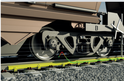
Flat wheel detectors