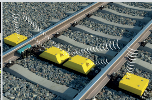
Hot box detectors