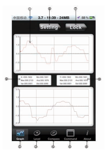
Table 2 iAngle interface description