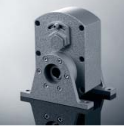
Fig. 2.5.1: Special Gear Unit MGV with 2 Support Angles