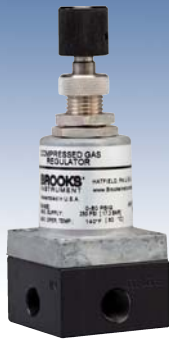
Model 8601 Pressure Regulator