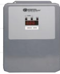
WALL MOUNTED MODEL LC100

The MP220EX is a two-channel, explosion proof, wall mounted, control unit rated for use in Class 1, Div. 1, Groups C, & D (B optional) hazardous areas. Operation via magnetic wand allows the unit to be operated without opening the cover, thereby ensuring that hazardous areas do not require declassification. 4-20 mA outputs are available as an option.