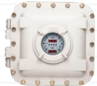
EXPLOSION PROOF MODEL MP220EX