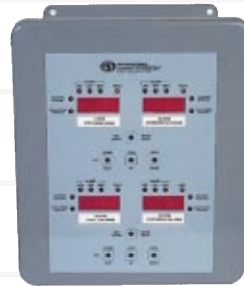
WALL MOUNTED MODEL MP204