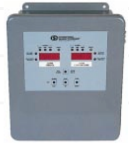
WALL MOUNTED MODEL MP202