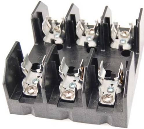
3 pole shown