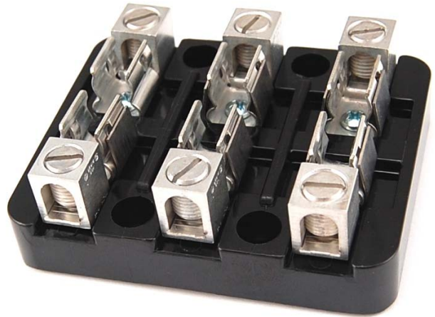
3- pole shown

Reinforced Class T Fuse Holder 30 Amps, 300 Volts AC/DC