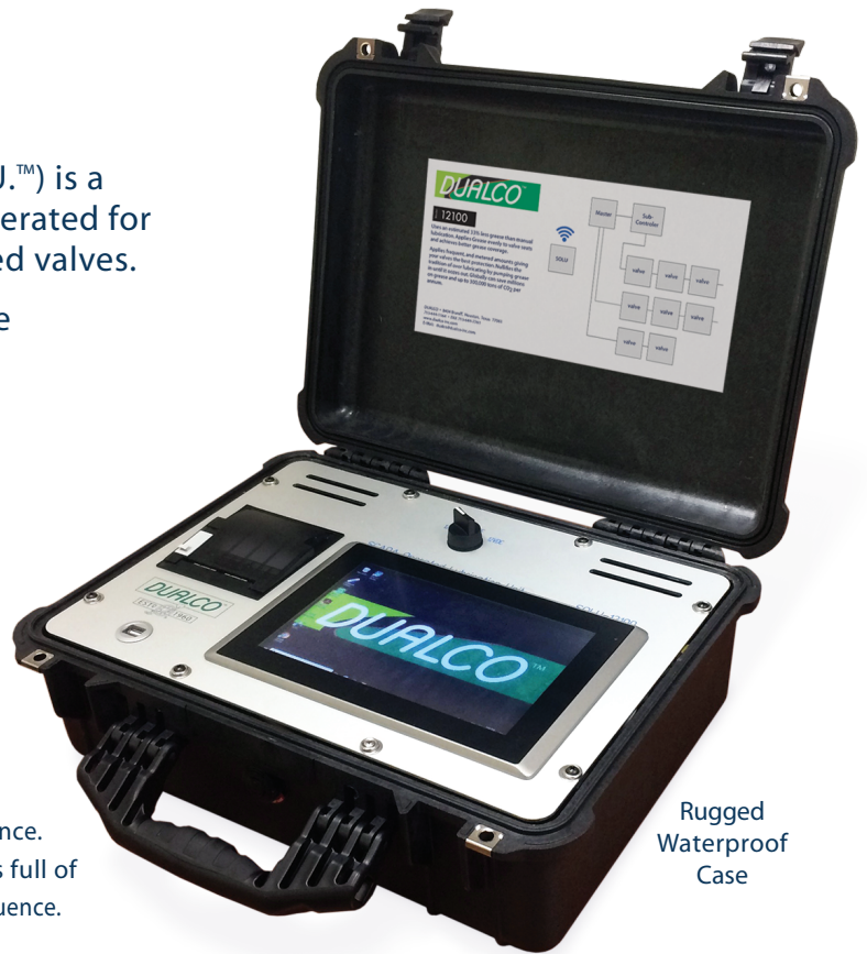
Rugged Waterproof Case