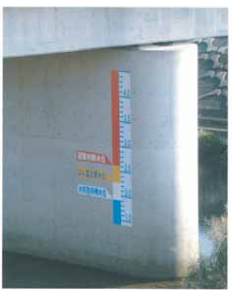
Example: Staff gauge for hazard