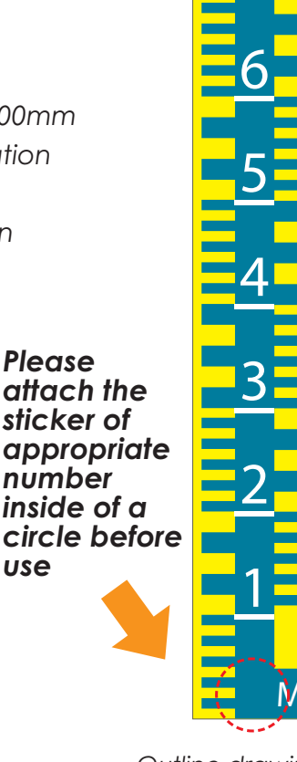
Outline drawing of standard specifications

XInformation in this document is subject to change without notice