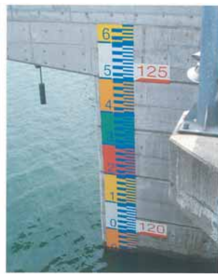
Example: Staff gauge for Dam