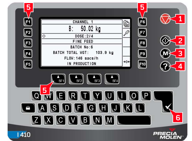
Single weigher view