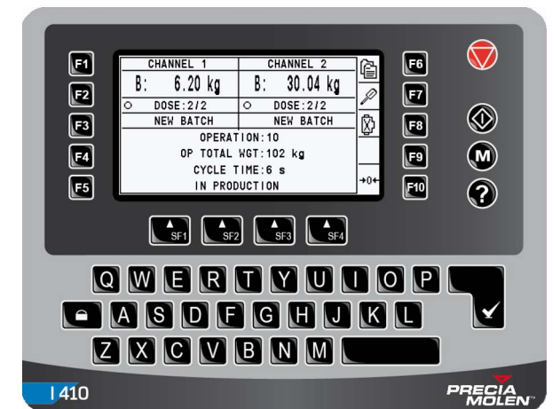
Dual weigher view

The F5 and F10 function keys are used to select the information displayed in each column.