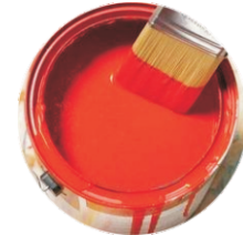
PAINT & EMULSIONS