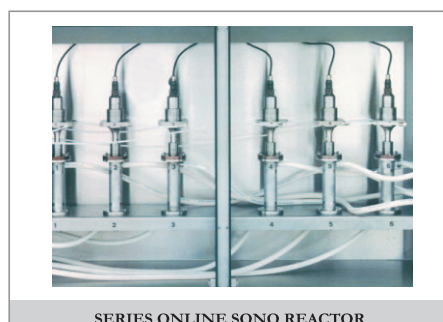
SERIES ONLINE SONO REACTOR