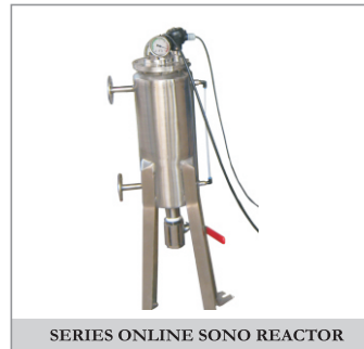
SERIES ONLINE SONO REACTOR