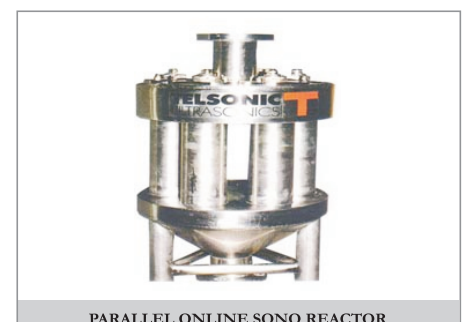
PARALLEL ONLINE SONO REACTOR