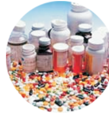
API BULK DRUG