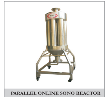
PARALLEL ONLINE SONO REACTOR