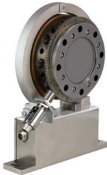
TQ-2000 series High-stiffness Torque Detector