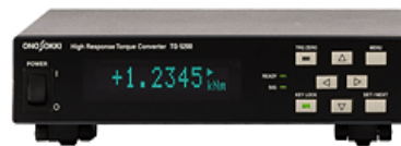
TQ-5200 High-response Torque Converter