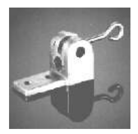
CAM CLAMP BUSHING